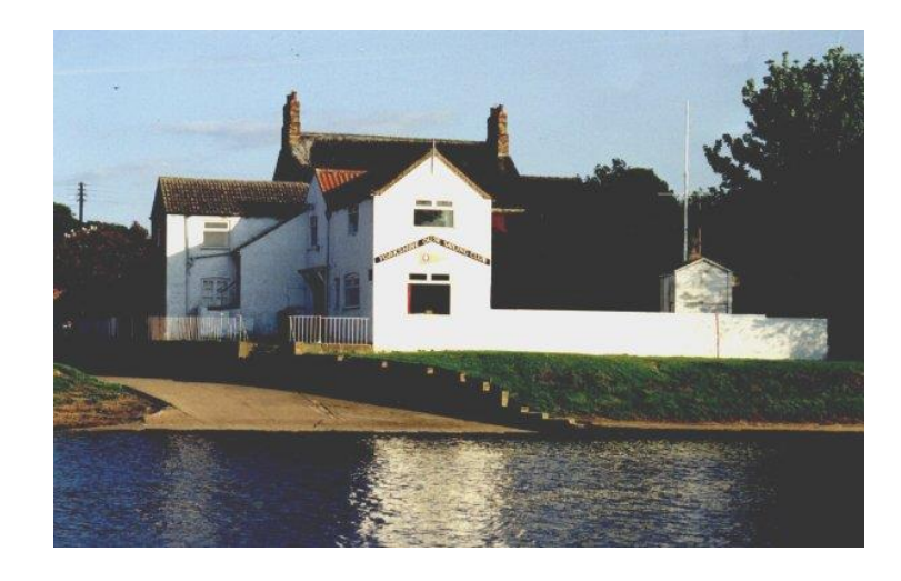
Yorkshire Ouse Sailing Club, Ferry Lane, Naburn, York, YO19 4PN