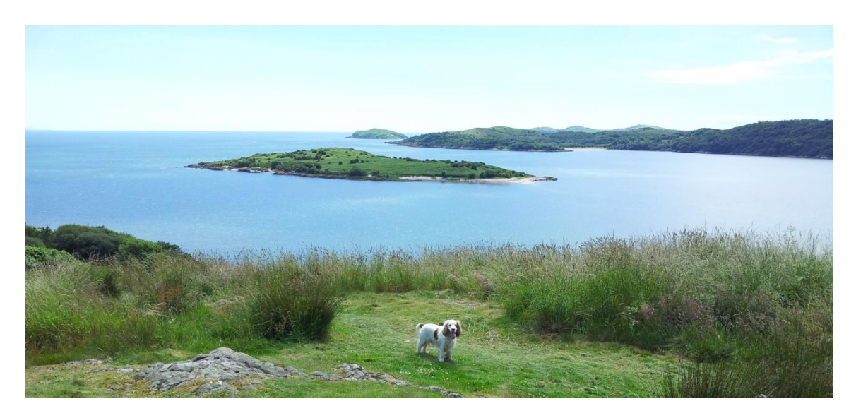
The sailing area from above the Starting Hut with Rough and Hestan Islands (and Wilson)